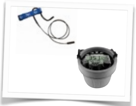
Cox Box and Head Set (Coxswain Only)