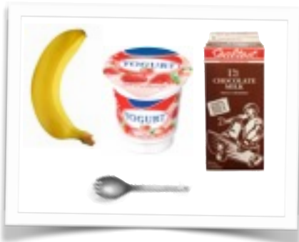
Post Race Snack