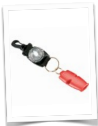
Fox 40 Light and Whistle (Ottawa Rowing Club Office)

Ottawa Rowing Club encourages athletes to be prepared for each practice. Key items include safety equipment, proper workout gear, and a snack post-workout. Here is a checklist to get you started: