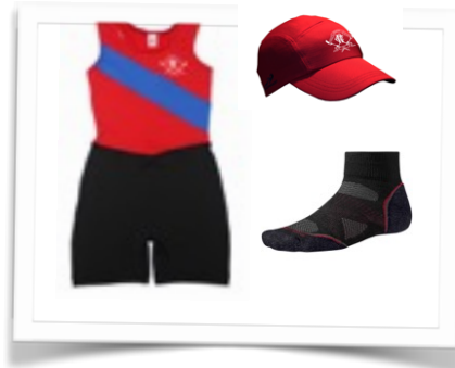
ORC Uni- Suit, ORC Hat, Sock