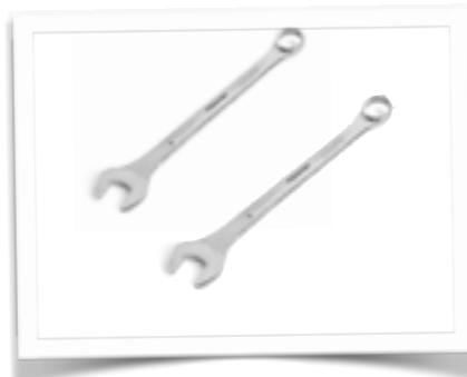
Two 7/16 Wrenches