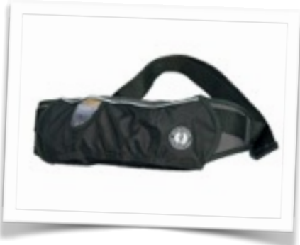
Mustang Belt PFD (COMPETITIVE CREWS ONLY) (Chandlery)