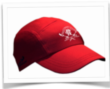
Club Hat (Row West)