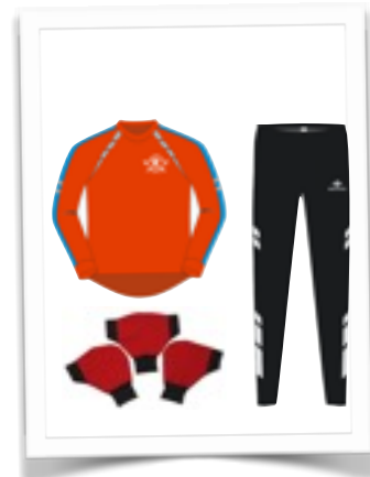
Cold Weather Layers