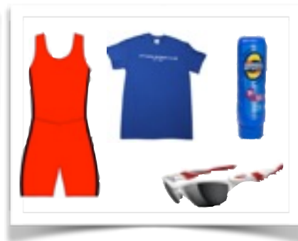
Warm Weather Layers