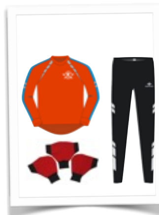
Cold Weather Layers