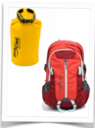
Waterproof Bag and Day Backpack