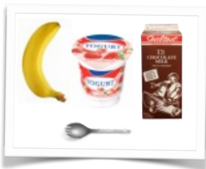
Post Workout Snack