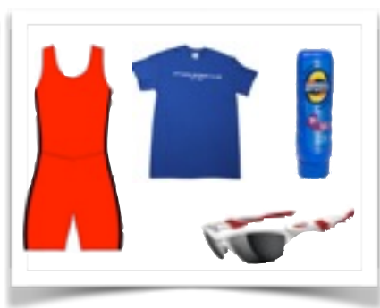
Warm Weather Layers